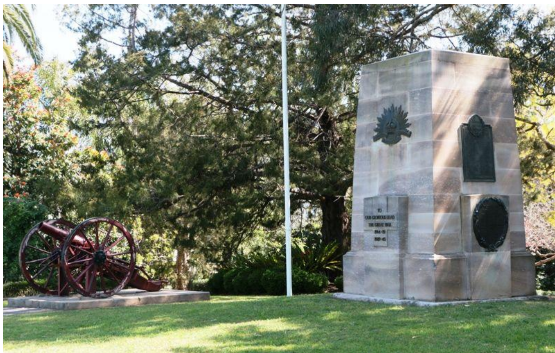
Camden Cenotaph