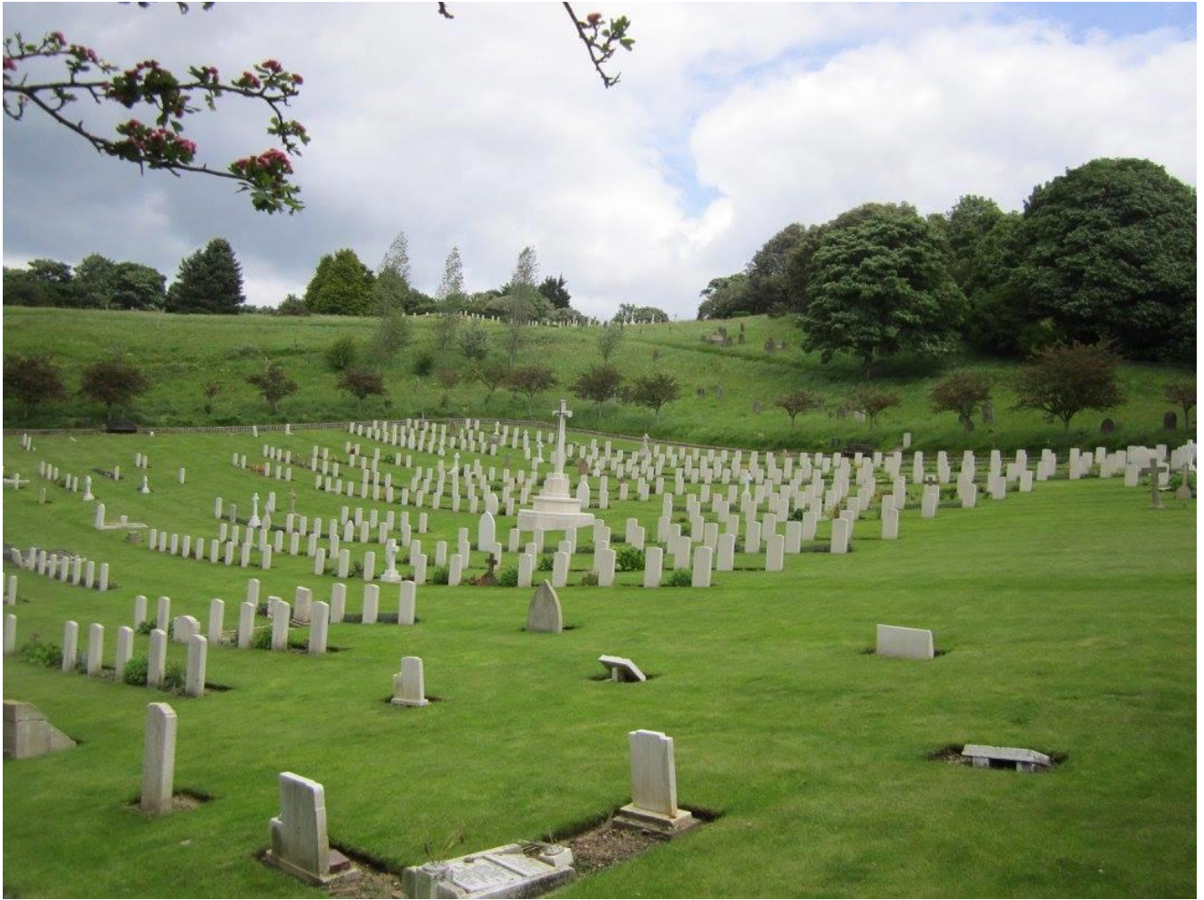
Shorncliffe Military Cemetery, Folkestone